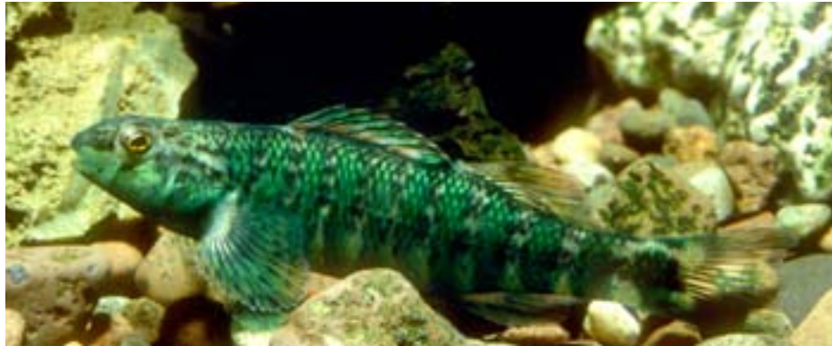
Banded Darter, Etheostoma zonale