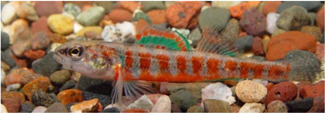
Iowa Darter, Etheostoma exile