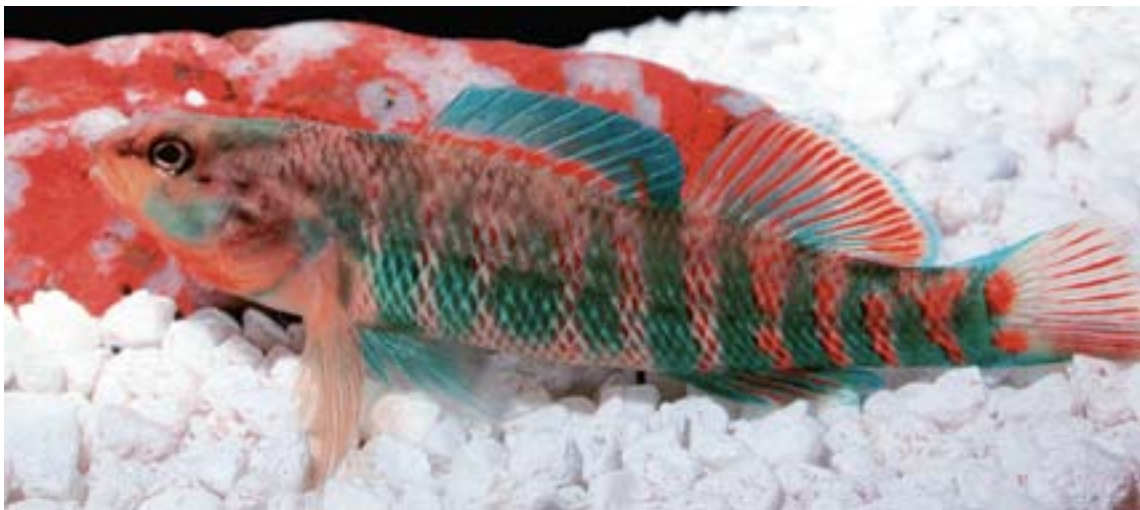
Rainbow Darter, Etheostoma caeruleum , (Reserve Best of Show 2002)